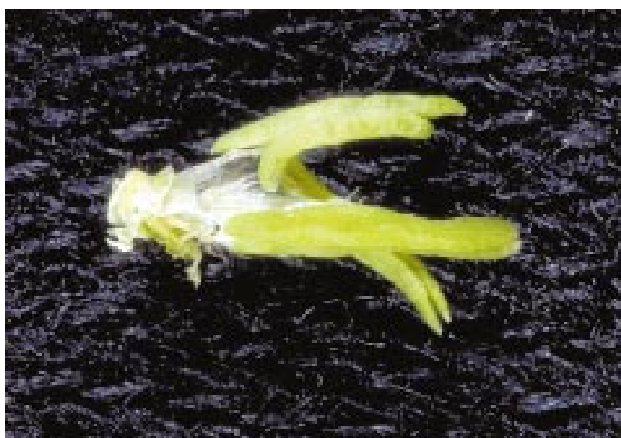
Figure 14: Close-up of twisted anthers and unopened whitish stigma shown in Figure 13.