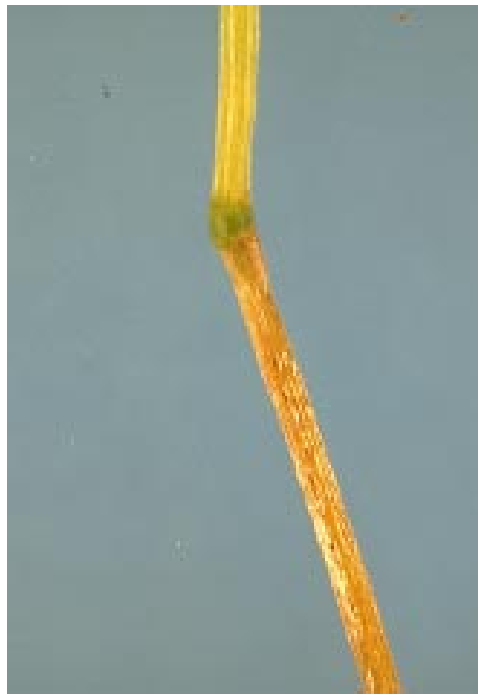
Figure 7: Discoloring and roughening of the lower stem are symptoms of spring freeze damage.

Mild stem injury does not appear to interfere with ability of wheat plants to take up nutrients from the soil and translocate them to the developing grain. Microorganisms might infect injured