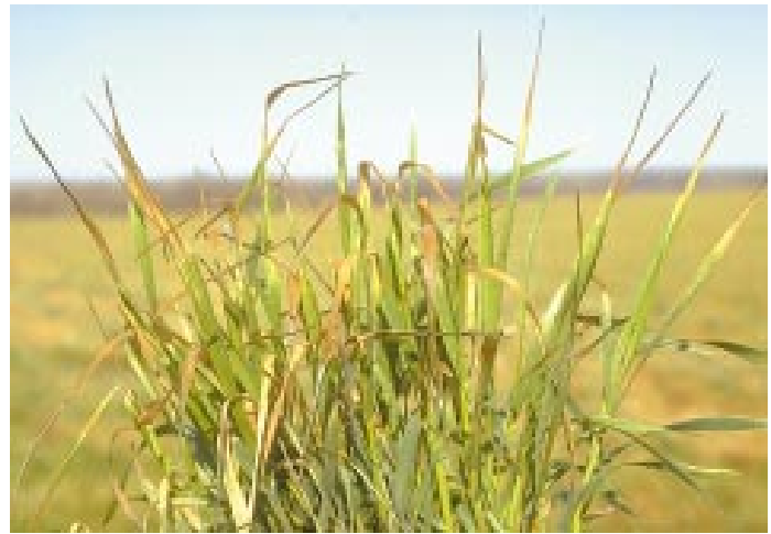
Figure 2: Leaf tip burn and yellowing are common spring freeze symptoms at the tillering stage.

The degree of injury to wheat from spring freezes is influenced by the duration of the low temperatures as well as the low temperature reached. Prolonged exposure to freezing causes much more injury than brief exposure to the same temperature. Temperatures at which injury can be expected, shown in Figure 1 and Table 1, are for two hours of exposure to each temperature. Less injury can be expected from shorter exposure times. Injury might occur at somewhat higher temperatures from longer exposure times.