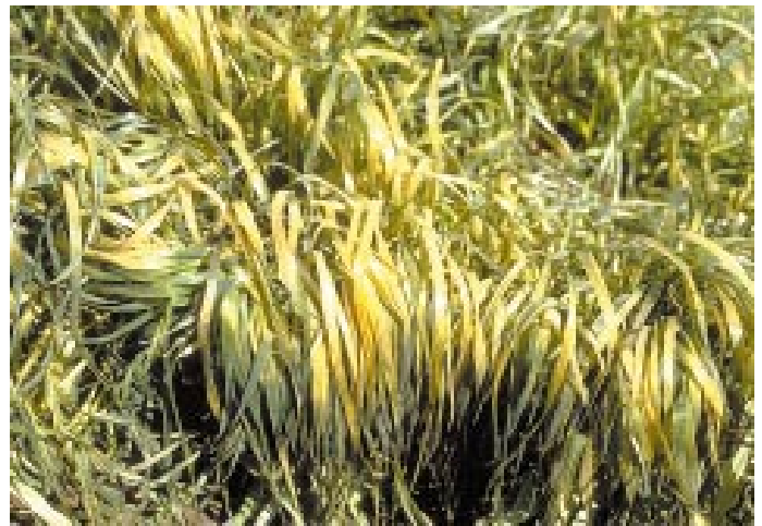
Figure 3: More severe freeze damage causes the entire leaf to turn yellowish-white and the plants to be flaccid. A silage odor may be detected after several days.