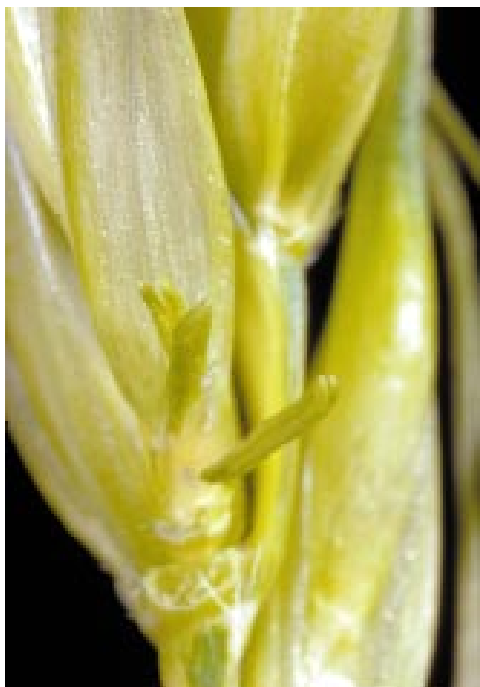
Figure 13: Anthers become twisted and shriveled, yet they are still their normal color within 24 to 48 hours after a freeze. A hand lens is necessary to detect these symptoms.