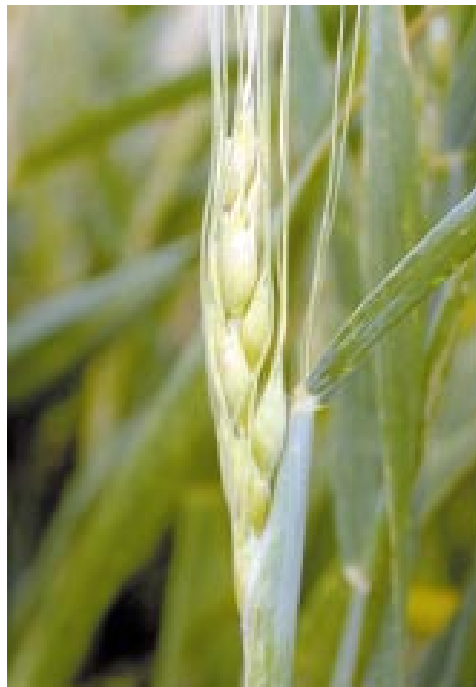
Figure 11: This spike is emerging normally, but the yellow, water soaked appearance, instead of the normal crisp, green spike indicates it is damaged.

Freeze injury at the flowering stage causes either complete or partial sterility and void or partially filled spikes because of the extreme sensitivity.