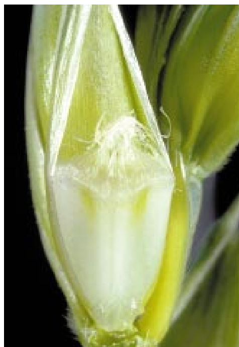
Figure 22: As healthy kernels continue to develop, they will contain a clear liquid.

Before destroying damaged wheat and planting another crop, growers should consider that production costs, except for harvesting and hauling, have been incurred. Planting a new crop will have its own production and fixed costs. Therefore, the return of the new crop over its production costs must be greater than the wheat's value over harvesting/hauling costs to make it worthwhile.