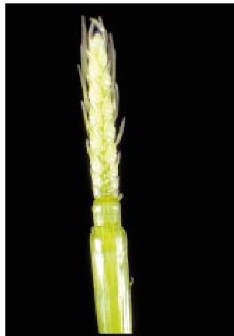
Figure 4: A healthy growing point has a crisp, whitish-green appearance.