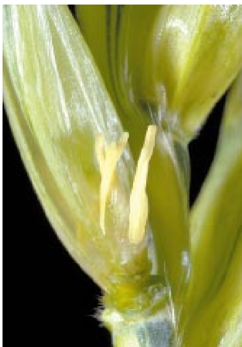
Figure 15: If damaged, anthers become white after 3 to 5 days and eventually turn whitish-brown. The anthers will not shed pollen or extrude from the florets.

Flowering proceeds from florets near the center of wheat spikes to florets at the top and bottom of the spikes over a 2- to 4-day period. This small difference in flowering stage when freezing occurs produces effects shown in Figure 20. The center or one or both ends of the spikes might be void of grain because those florets were at a sensitive stage when they were frozen. Grain might develop in other parts of the spikes, however, because flowering had not started or was already completed in those florets when the freeze occurred.