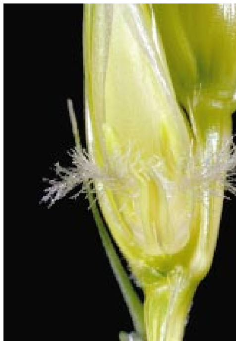
Figure 12: Healthy wheat anthers are trilobed, light green and turgid before pollen is shed. Each wheat floret contains three anthers. Healthy stigmas are white and have a feathery appearance.