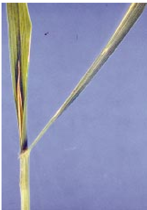
Figure 6: A yellow or necrotic leaf emerging from the whorl indicates the growing point is damaged.