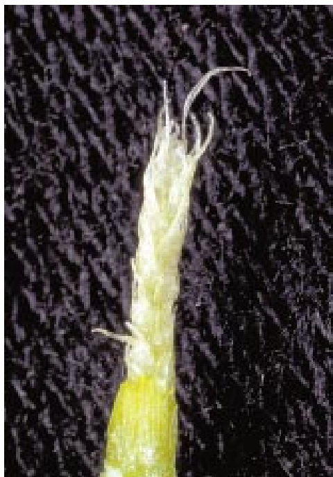
Figure 5: A growing point that has been damaged loses its turgidity and greenish color within several days after a freeze. A hand lens will help detect subtle freeze damage symptoms.

The many factors that influence spring freeze injury to wheat – plant growth stage, plant moisture content, duration of exposure, wind, and precipitation – make it difficult to predict the extent of injury. This is complicated still further by differences in elevation and topography in and between wheat fields. Official weather stations may not reflect true in-field temperatures. It is not unusual, for instance, for wheat growers to report markedly lower temperatures than are recorded at the nearest official weather station.